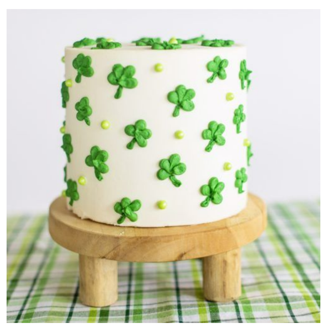
Cake Raffle Sunday, March 17, 11:30

Temple, New Covenant, and more for the quarterly Interfaith Green Team group on Thursday, March 21 at 7pm at UUBN.